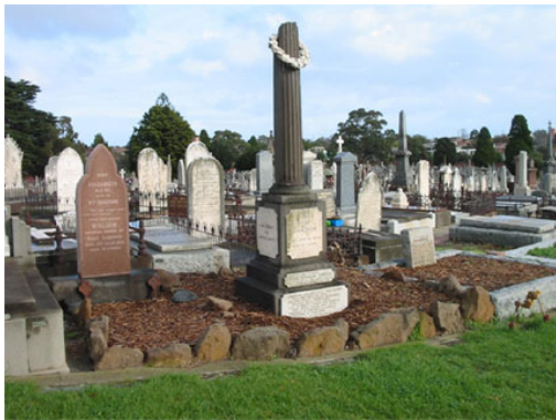
Grave of Adam Lindsay Gordon at Brighton General Cemetery

"Reproduced with permission of The Adam Lindsay Gordon Commemorative Committee Inc."